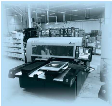
DTG DIRECT TO GARMENT